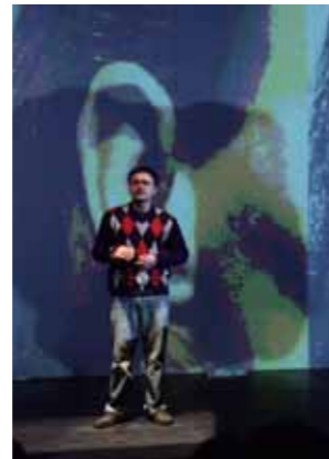
Cover and 7

Pro Helvetia New Delhi Swiss Arts Council A-69 Nizamuddin East Second Floor New Delhi 110013 India